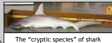
The "cryptic species" of shark