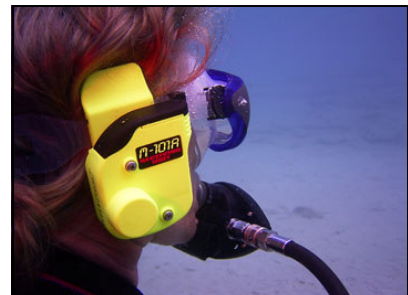
The M101A can be worn with a conventional SCUBA mask